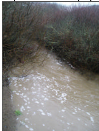
Cheney Gulch after a storm

We have updated some of our monitoring equipment to include ion chromatography to measure anions (nutrients) and a DO meter using new luminescent technology, both new methods are a considerable upgrade in data quality. CCWI also acquired hobotemps perfect for intensive